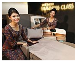
These 12 Airlines Are The Ones Skytrax Says You Should Be Flying Americans.org