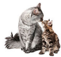
13+ Things You Didn't Know About Cats Reader's Digest